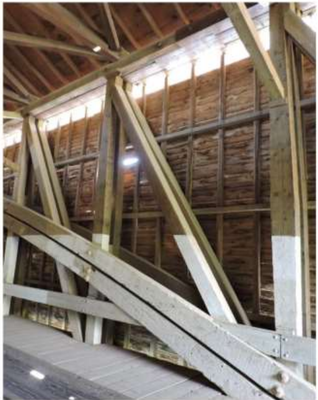
Notice the double arch, one above the other not necessarily connected to each other but they are bolted to the braces.