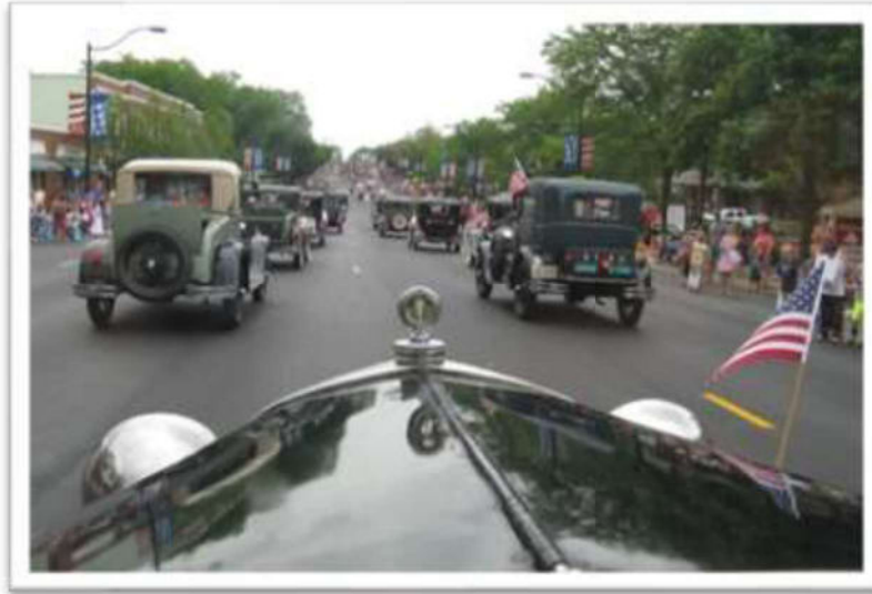
View from Tom Risley's 1931 Model A Sedan with COL. The Model A Club cars are in front in the Libertyville 2015 Parade.