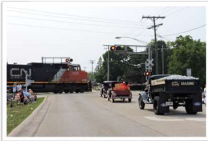
Freight train stops COL. Model A Club cars in the Mundelein 2015 Parade (weird/unusual happening)