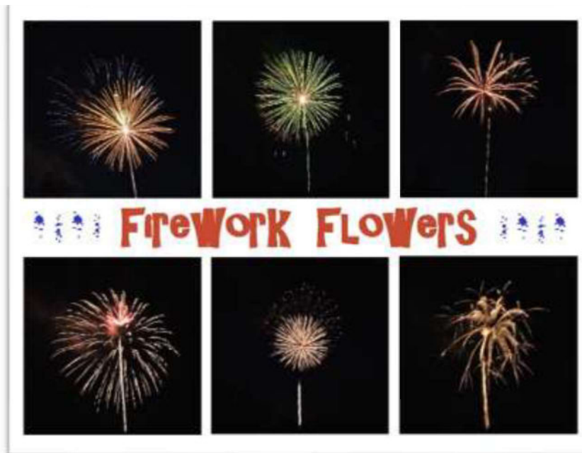
The 4th picture is a sampling of "flower" pictures that I took at the Grayslake Fireworks 2015.

Pictures on pages 13 & 14 were provided by Jen Risley.