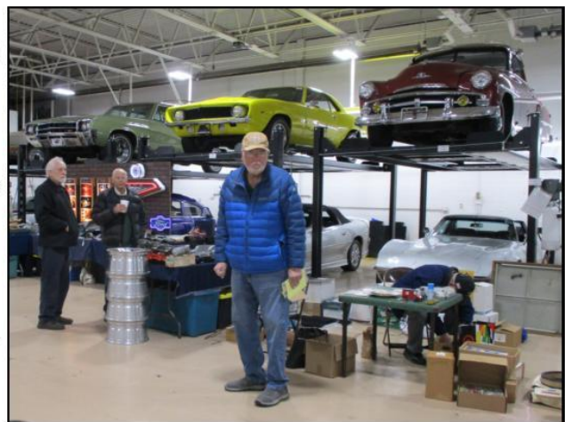
Vendors set up their wares in front of some of the classic cars for sale.

Despite the challenges, the day was a huge success . First and foremost, we made more than 3 times the profit we had last year. Second, the vendors had excellent sales and have promised to return next year. Third, the customers commented on how great it was to have, not only a swap meet, but a car show too.