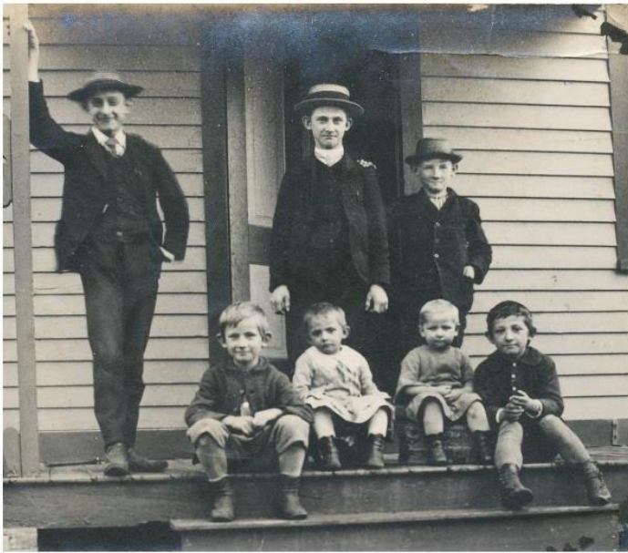
Date of photo unknown - 1887??