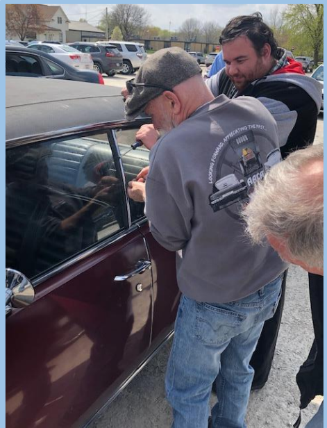
Ooops! Someone is Locked Out