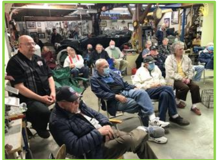
Members listening intently to info on our first tour of the year.