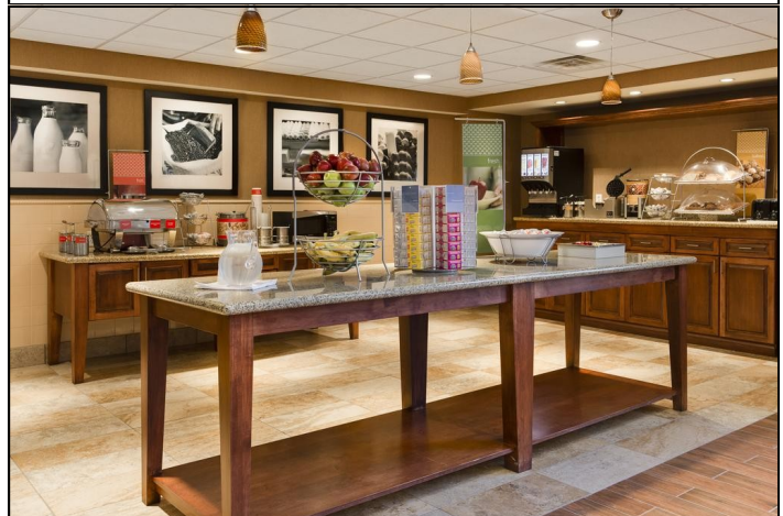
Breakfast area featuring a hot breakfast.