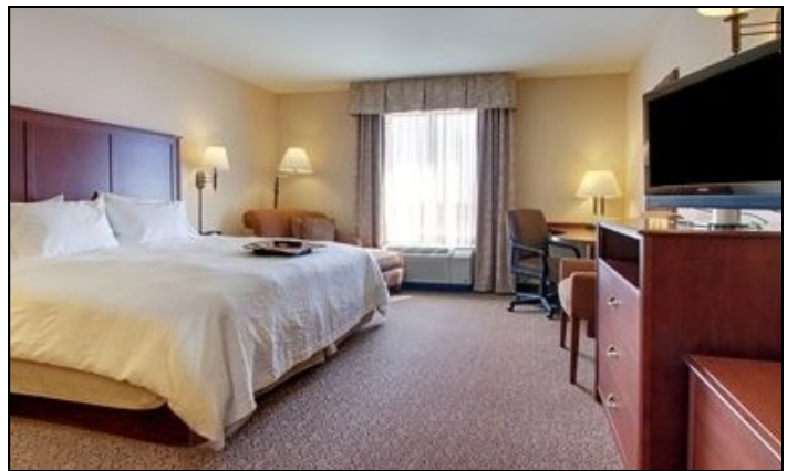
Room with one king bed.

also a fully equipped business center with free printing.