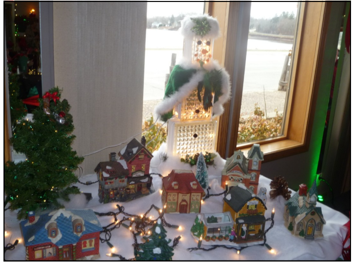
Delightful décor adds to the holiday feeling.

On Dec 10 th , about 60 members of the Waukegan/North Shore chapter came together to spread holiday cheer at their annual Holiday/Christmas party at Parkway by the Lake. This is the same site as last year and they did not disappoint. Delightful decorating, delicious dining