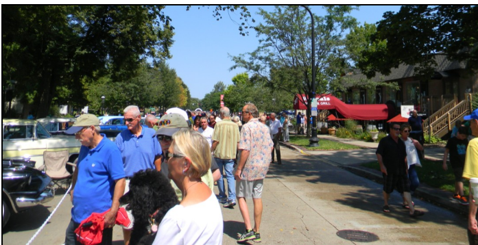
Crowds enjoy the sun and the show.