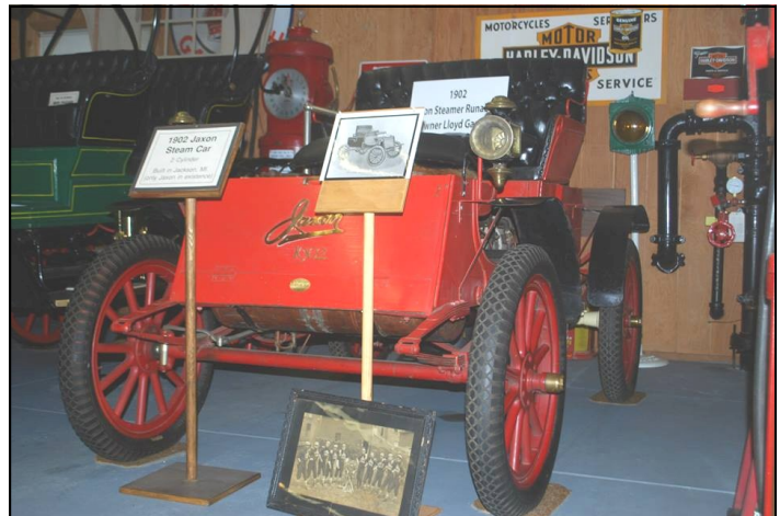
1902 Jackson Steam Car - only one in existence. This was built in Jackson, Michigan.