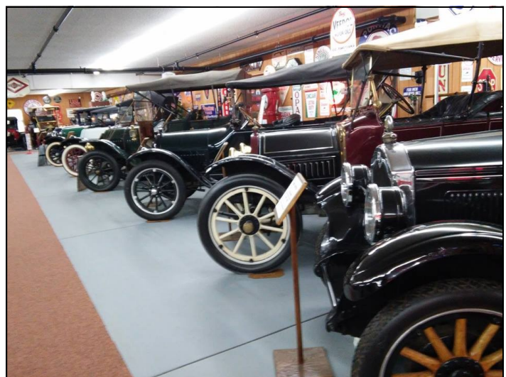
More of Lloyd Ganton's collection.