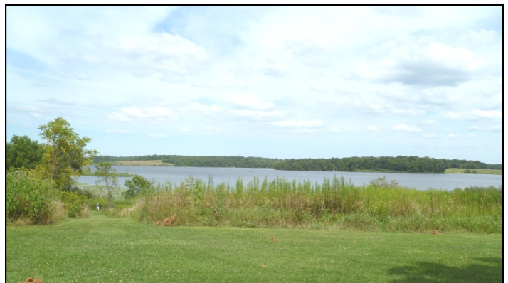
Panoramic view of Shabbona Lake from the picnic pavilion.