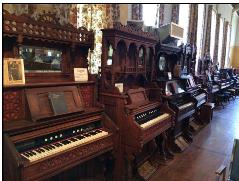
Some of the beautiful reed organs at the museum.

table or a person's lap to play it. Air was forced through reeds to produce the musical notes by means of bellows. By the early 1900's organs were permanently