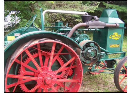
Rumely 12-20 Model K tractor purchased in the 90's from a man in Canada. It still has the original fenders and runs well.

Since that time, they have bought and sold hundreds of vintage tractors and steam engines throughout the US, Canada and Europe. The founders especially like early steel wheeled tractors and generally have an extensive inventory of rare and unusual vehicles.