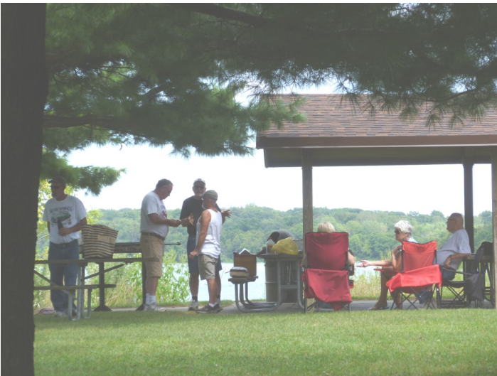
Chapter members congregate under pavilion.