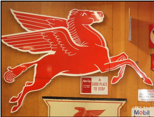
One of the gas signs from the Ganton collection.

The museum also has a large collection of pedal cars, gasoline signs and pumps and toys. This will be a fun stop at a hidden treasure of a museum.