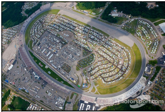
Aerial view of Michigan International

We will be going behind the scenes of the facility. Part of the tour will take us out on the