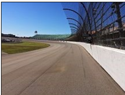
Turn #1 at Speedway.