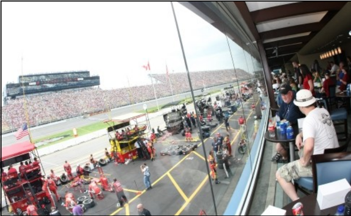
View from Pit Road Suites

track to experience what an 18° bank on a turn REALLY means. Then, we will leave the track and move onto the road course. We will go through the infield tunnel and stop at the media center. While in the infield we will see the Pit Road Suites and then go to the roof to get a view of the whole track.