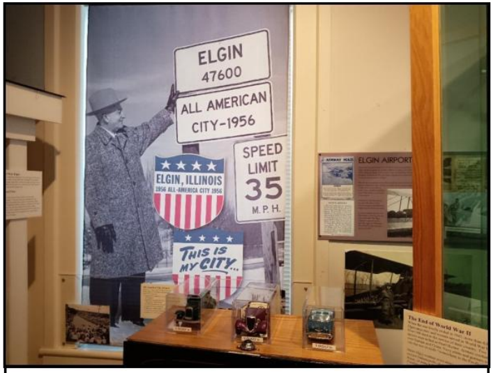
In 1956 Elgin was named an All American City for its innovation and civic involvement.