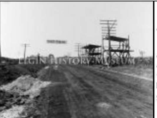
From the Museum collection, this is a picture of the starting line and race course taken in 1911.

Course was mostly packed down dirt that ran alongside farm fields. Still, I was surprised by how fast they went for that day, getting up to 80 mph!