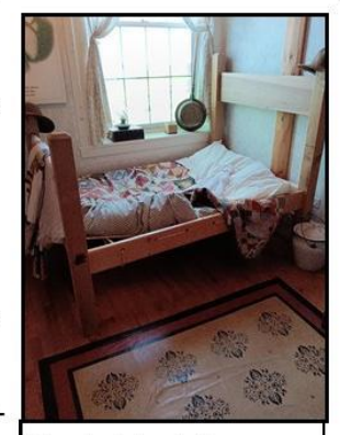
Typical bed from pioneer days. They all had to be really short or they slept curled in a ball.

We found that Elgin has a lot of fascinating history.