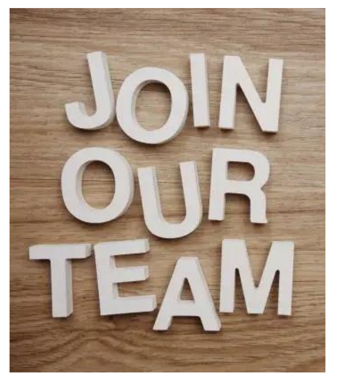
Do you like talking to people? Are you a wan-a-be salesperson?