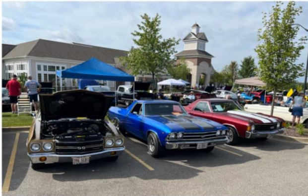
You don’t see El Caminos every day, but there were 4 of them at this show, including ours!

What’s better than a beautiful summer day, wonderful classic cars and a chance to support a very worthy charity? Nothing in my book and that’s why I loved attending the Grand Dominion Car Show in Mundelein on Sunday, August 13th. This show brought in over 200 cars and one beautifully restored fire engine. The folks at Grand Dominion, a Del Webb residential community, are very appreciative of the people who bring their cars and opened a nice hospitality space for us, with coffee, water, donuts, and treats. There was music and raffle baskets and a food truck too. All proceeds of the show support the Fremont Township Food Pantry and they raised over $8,000. that day. Lots of happy people went home with those baskets and lots of happy children (and adults) got rides on the fire engine. And all of the AACA members who attended had a wonderful day.