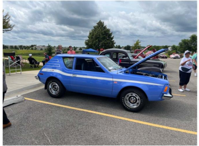
Not a member's car, but I couldn't resist including it as my first car was a 1974 Gremlin and I still love them.