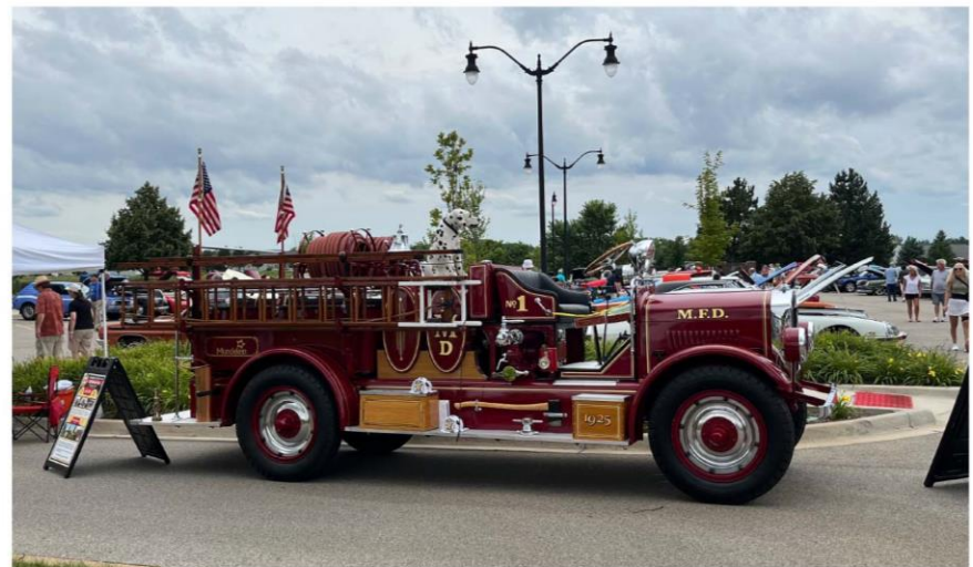
And here's that restored Mundelein Fire Engine.

A great day, a great show and lots of great people and their cars.