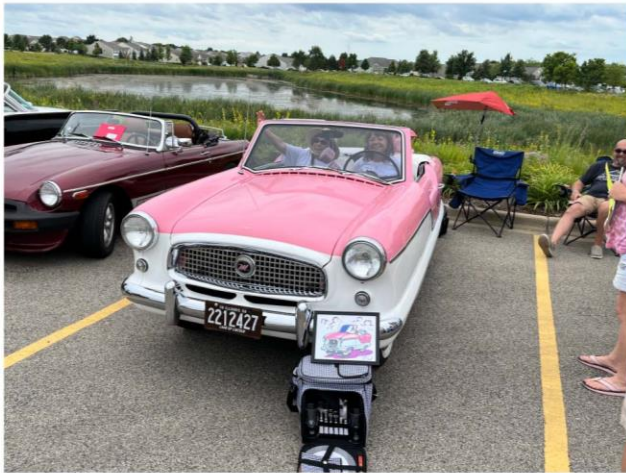
Two of the amazing volunteers enjoy this Nash Metropolitan convertible.