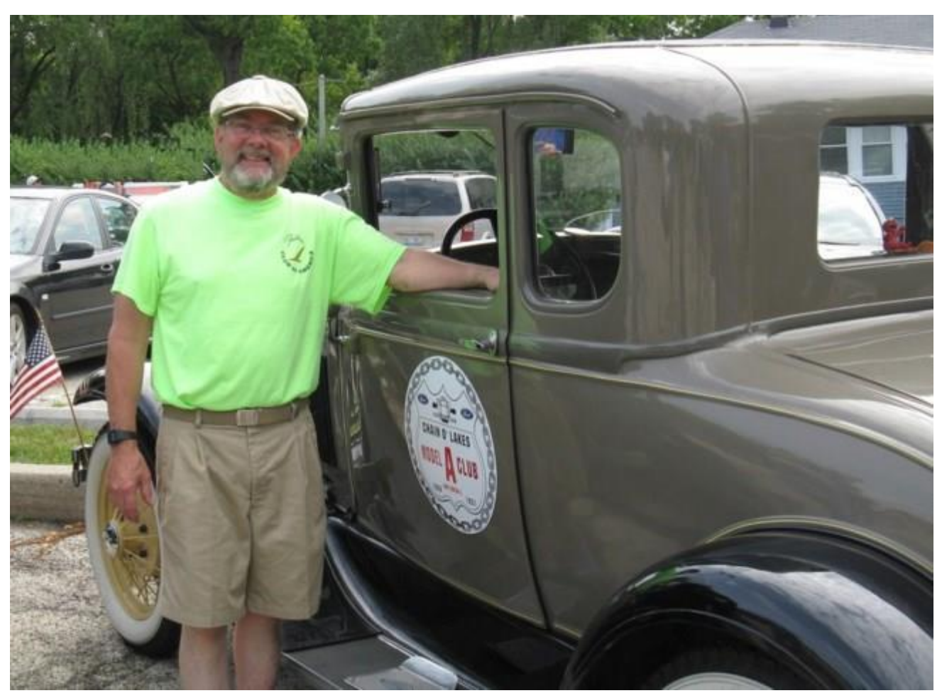
IN THE CARE OF