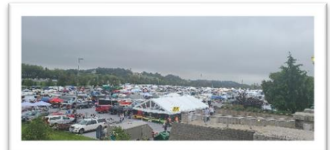
A view from the bridge over half the swap meet. Vendor spaces as far as the eye can see!