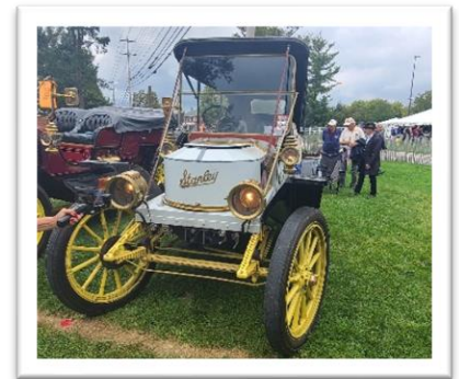
Stanley steam powered motorcar