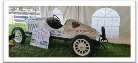
1926 Pontiac Race Car