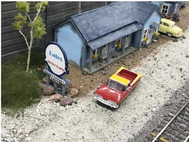
This display was so lifelike I could see myself driving down the street.