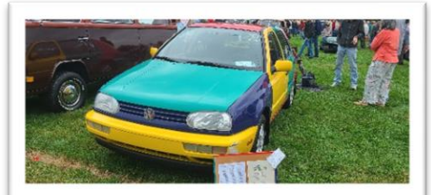
1996 Volkswagen Golf Harlequin (#10 of 264)