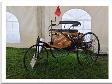
1886 Benz Motorwagen Replica (the first automobile).

As the show concludes and everyone heads home, there is one thing for sure. They have great stories to tell and are equally looking forward to next year's show. Check out this sampling of photo of all the gems and activities found at the show I attended this past year and enjoy!