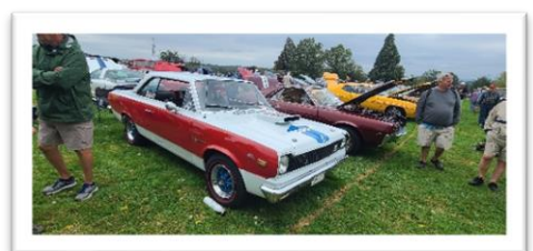
1969 AMC SC/Rambler