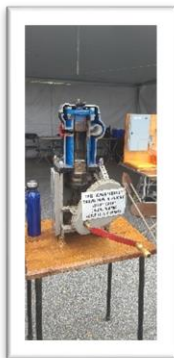
Not just fun but educational. Here the Willys Knight group shows a cutaway model of a sleeve valve engine to show how it functions.