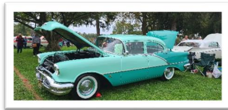
1956 Old Twin Nash Metropolitans smobile Super 88