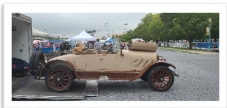
1921 Stephens Salient Six (Illinois Built)