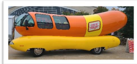
Not vintage but of special interest. The Wienermobile! The official public relations car of the Oscar Mayer Company.