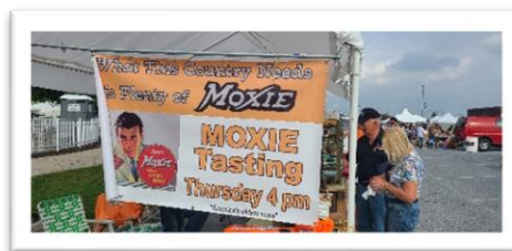
A tradition within a tradition. The annual Moxie Tasting on Thursday, where one can try the distinctively different soda, the official soft drink of Maine. It is quite an acquired taste and an interesting experience.