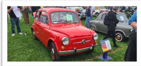
1979 Zastava 750 (Yugoslavia)