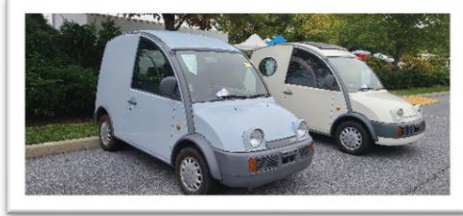
A pair of retro styled 1990 Nissan S-Cargos (Japan)