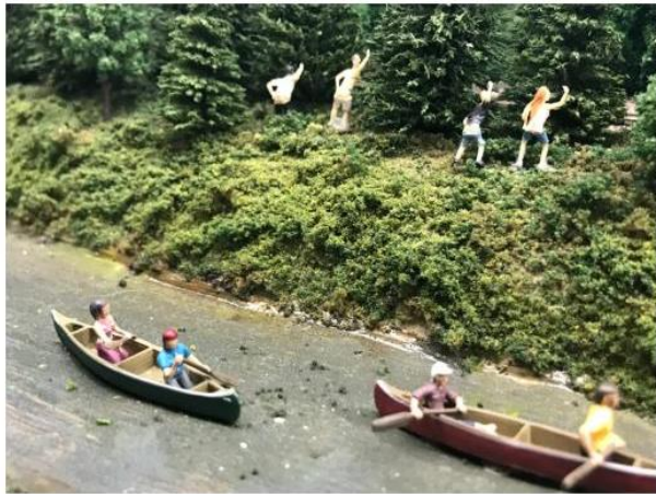
Look closely and you'll see why this display was called "Moon River"