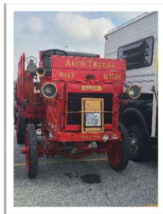
1912 Alco Truck. This truck, made by the famous Locomotive manufacturer is the only Alco truck known to be running.