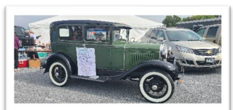
1930 Ford Model A