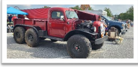
1944 Dodge Power Wagon