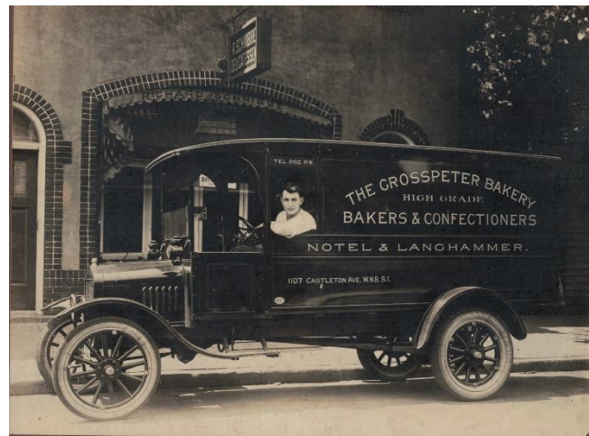
Photo 1: Touring car circa 1912, five-digit plate so a populated state, can't read where, may be a Cadillac. Photo 2: Tour bus, possibly a Rapid, about 1912, unknown location Photo 3: Another tour bus, August 13, 1914, Provincial Education Building, Toronto Canada. This was a few days before the start of WWI. Photo 4: Grosspeter Bakery. Where?? Model T truck, of course. Photos are cabinet cards.