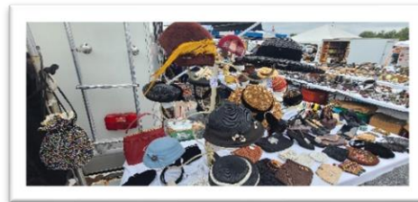
It's not just car parts, many vintage clothing and other items can be found as well.