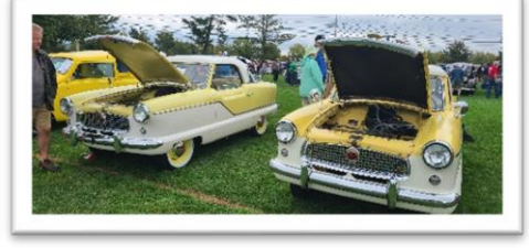
Twin Nash Metropolitan