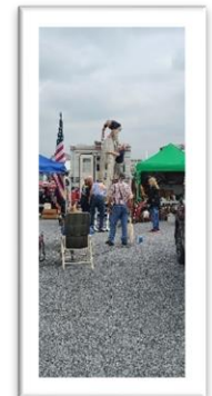
Bringing down a recently purchased item from the "top shelf" of the camper. What is it? I don't know. It is now somebody's new treasure.