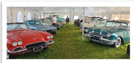
A nice sample of vintage autos under a tent on the grounds.