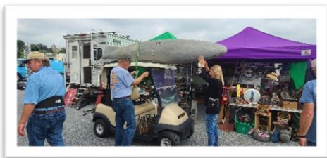
Figure 1 The happy buyers securing their new found treasure to bring home.