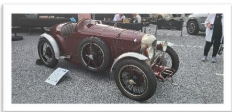
1927 Amilcar (France)