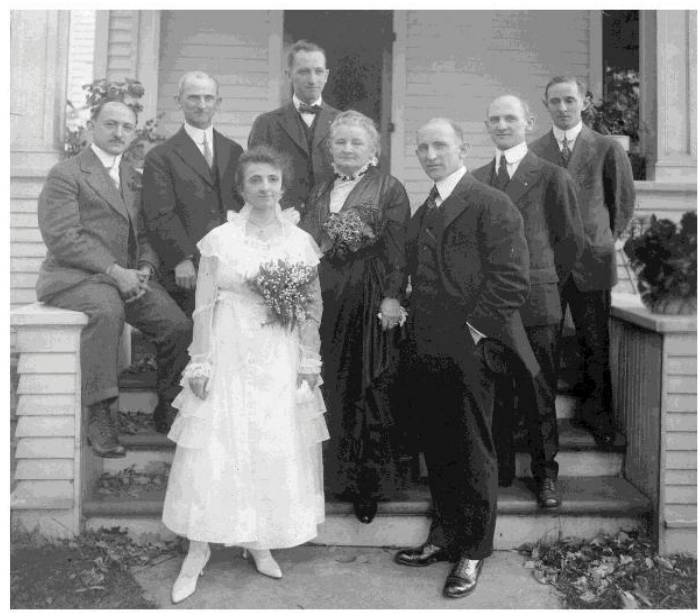
Date of photo unknown - 1887??