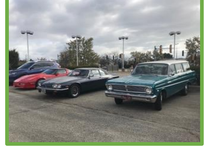
The old and the new.