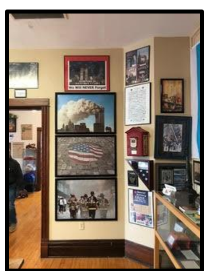
Tribute to Sept 11th

We started in Fox River Grove following lovely country roads leading to the Fox River; We passed factory buildings along the river that dated back to the founding of Carpentersville, including the former Haeger Potteries building. Some of the pieces of high-end glazed art pottery produced in this building are collectors' items today. On past the Grand Victoria