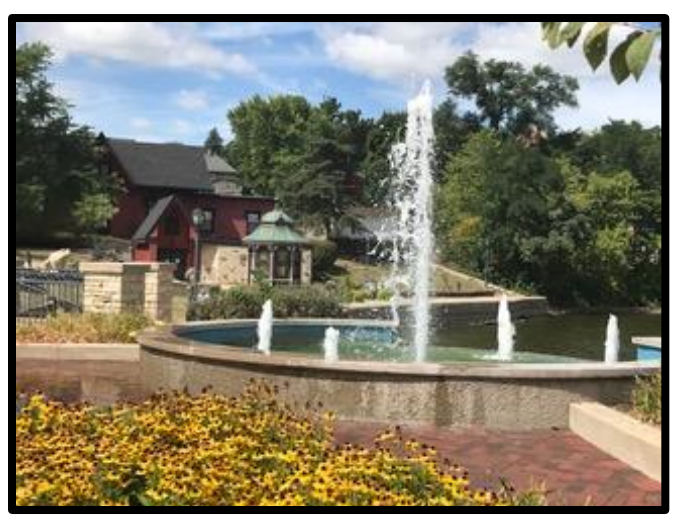
The fountain at the Batavia Depot Museum.