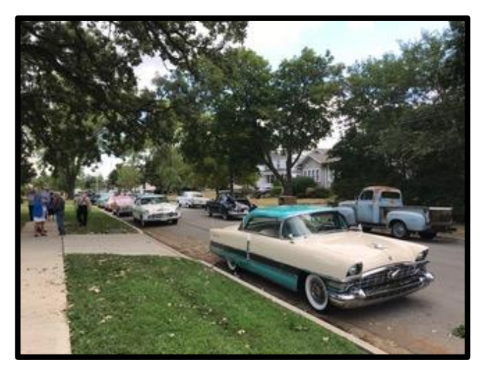
So many cars lining the street in front of the Fire Barn, and this is only some of them.