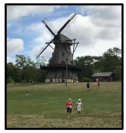
Darlene Sobczyk and Renee Grutza checked out the Windmill

Once back on the road, we passed through South Elgin, known at its founding in 1847 as Clintonville, and through St. Charles with it's beautiful Pottawatomi Park; the Arcada Theatre and the art deco style City Hall, built in 1940. Along the Fox River, south of Rt 64, we passed Langum Park,