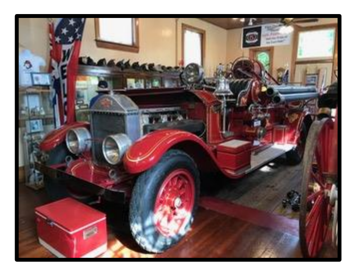
One of the 3 fire engines in the barn.