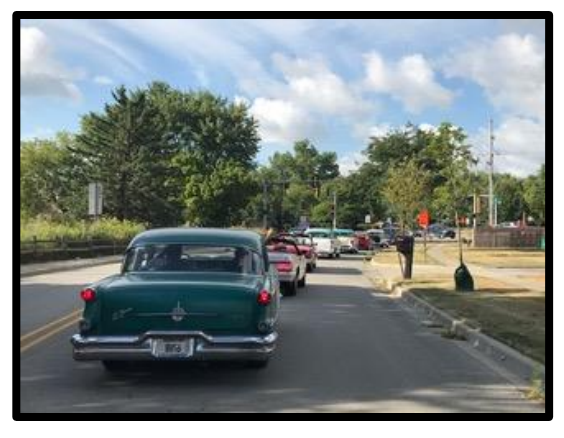
And we are rolling.....