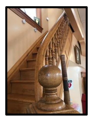
Amazing original woodwork in the Fire Barn.