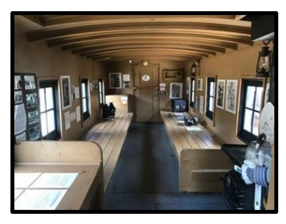
Sleeping quarters for the railroaders in 1907. Comfortable?