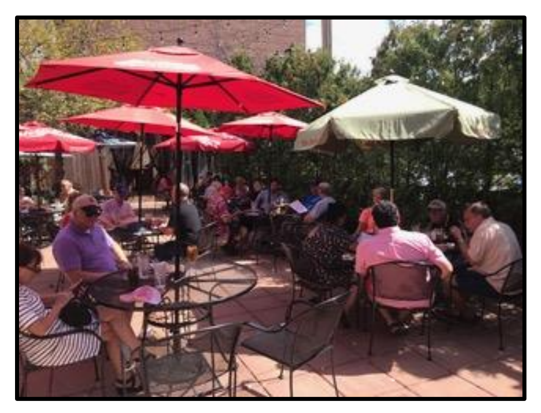
Dining on Aurelio's Patio.