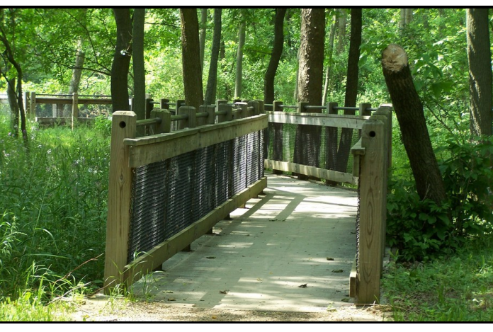
Linear Park walk-way in City Park.