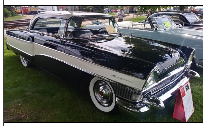
A pristine 1956 Packard Super Clipper among the Studebaker's.