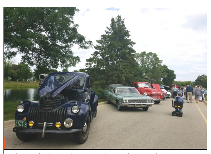
A line of Chevrolet vehicle as far as the eye could see were at the show.