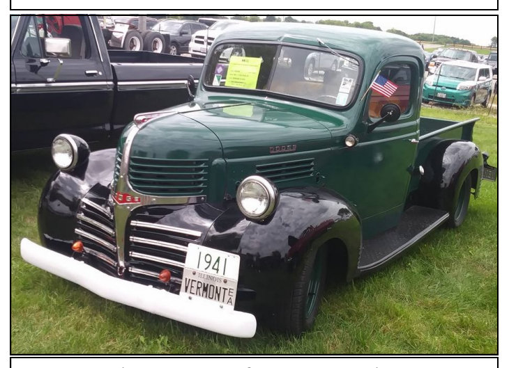
A 1941 Dodge Pickup in fantastic condition. Beautifully restored!