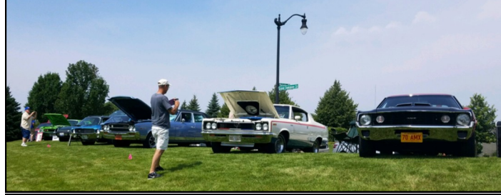
A fine collection of Teague designed AMC's at the show