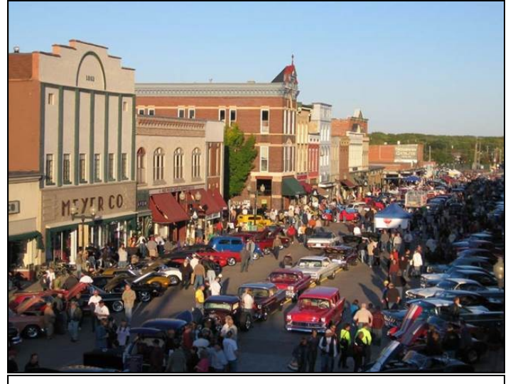
Editor's Note: Couldn't resist including this picture of their Saturday Night Cruise Night. Obviously, there must be car lovers in this region too.