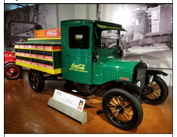
Above: This is a 1927 Model TT delivery truck.