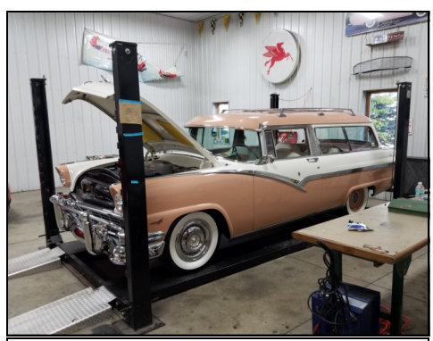
1957 Buick Caballero in the process of being restored.

The next morning, we set out on the tour with a short trip to the Demming collection.