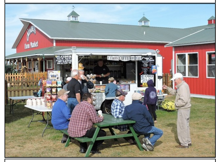
Stade's Farm coffee & donuts and time to sit and chat with friends before starting.