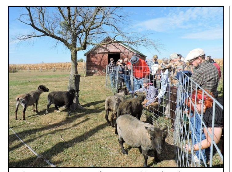
Other members are fascinated by the sheep.