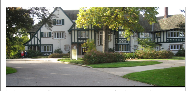
The beautiful Kellogg Manor which was the "summer home" of the Kellogg family.

In 1951 when Kellogg died, the grounds were donated to Michigan State University as the Kellogg Gull Lake Biological Station.