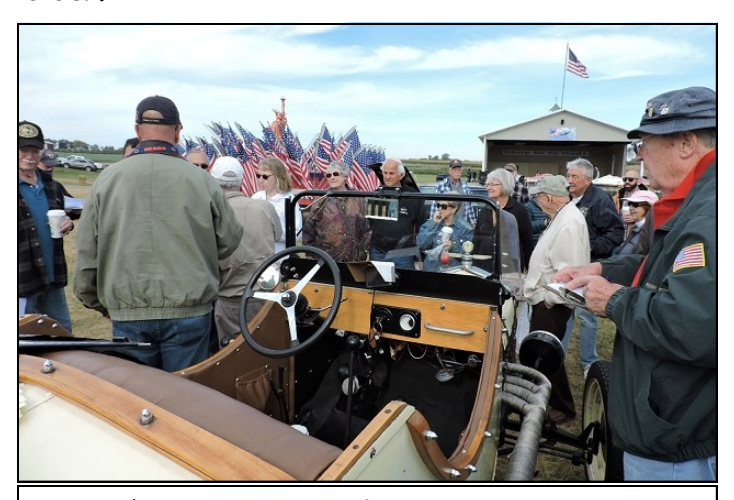
Drivers' meeting at Stade's Farm

On October 1st, the Waukegan - North Shore Chapter had their Pre - War Tour, and what a tour it was! The tour began at Stade's Farm in rural Mc Henry for Coffee and Hot Apple Cider.