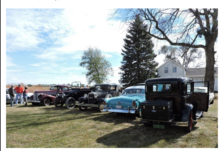
Parked at Grace Farm studio.

The afternoon found us back on the road going to Grace Farm Studios, a specialty farm specializing in raspberries and Icelandic wool. There is also a small art gallery specializing in a rustic motif.