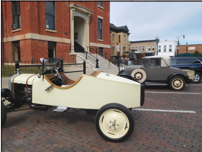
More views of the Woodstock Historic Square with member cars parked.