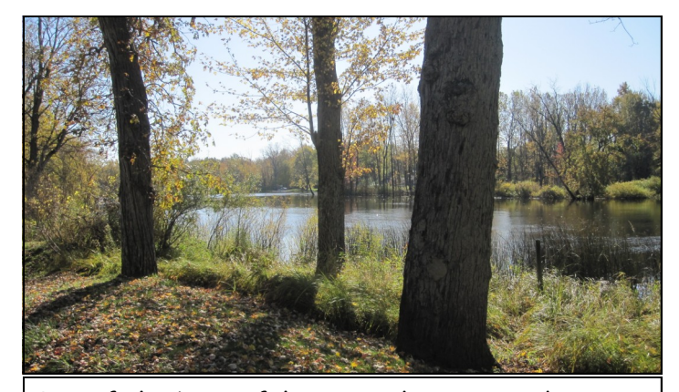
One of the beautiful scenes that greeted members on the tour.

A short drive along lovely scenic roads brought us to the main event for Friday - the Gilmore Museum.