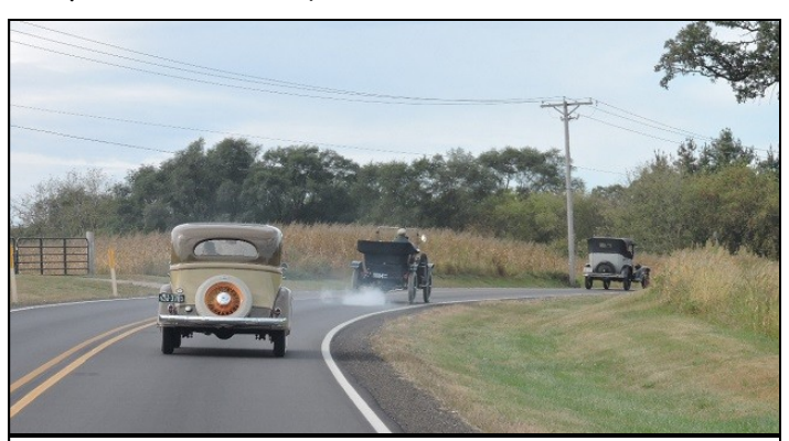
Touring the back roads with Pres Helgren, Mike Roach and Mike Passalaqua.

The tour then traveled along back roads only the locals knew about (and some forgot about) to the historic Woodstock Square to stop and visit the Old Courthouse Arts Center and the shops around the square.