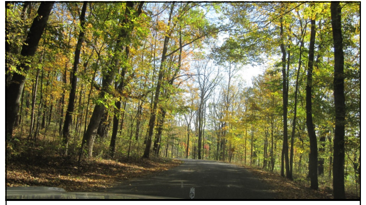
Every where we went we were pleased to find good roads surrounded by glorious canyons of trees in their fall dress.

After another lovely drive through the countryside, we arrived at GoGo Classics.