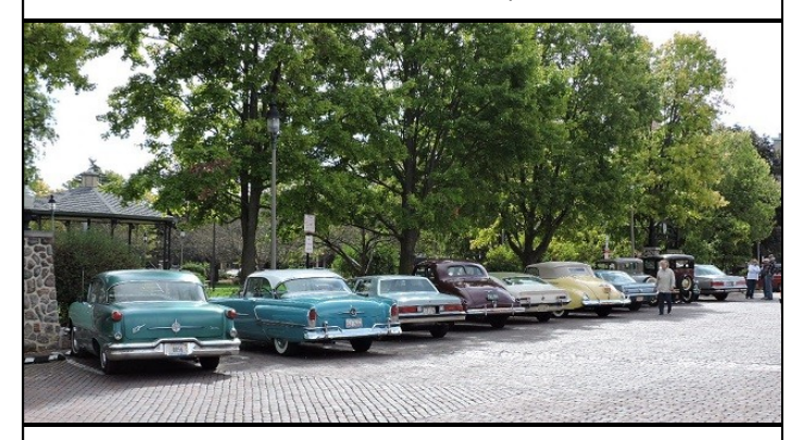
Woodstock's Historic Square visited by our historic line-up of cars.