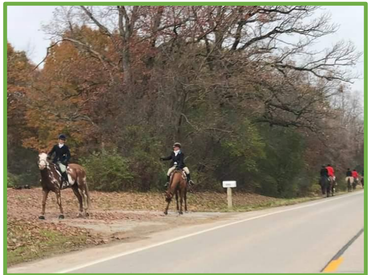
Horses with the fall backdrop really helped us immerse ourselves in a British feel.