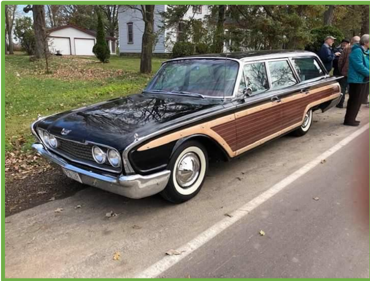
A wagon fan such as myself can certainly appreciate this nice restoration.