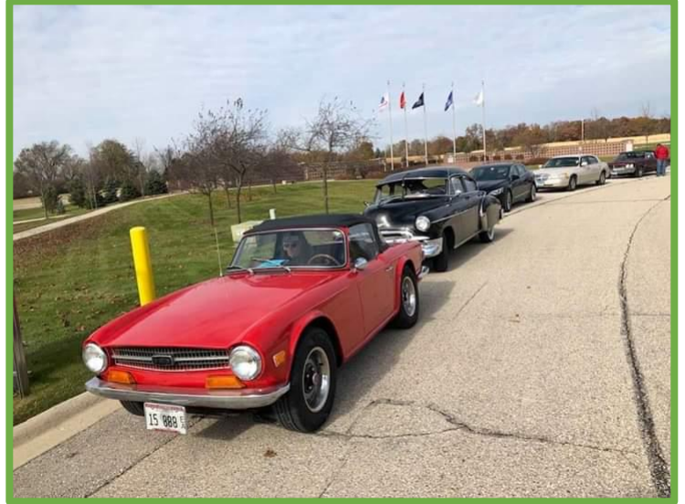
One of the rows of cars while having our rest stop in Union Grove. There were a nice mixture of automobiles there, even with how the weather had been prior.